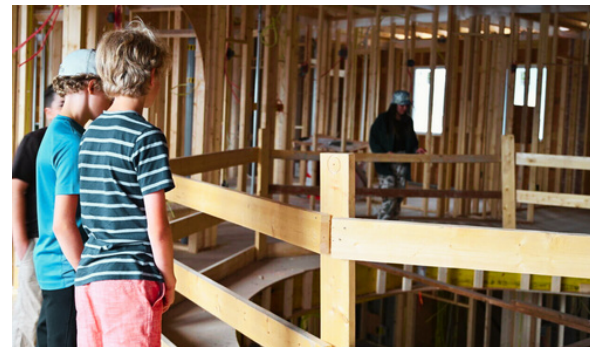
Youth inspect the construction of Foundry East Kootenay at 100 12th Ave S, Cranbrook.