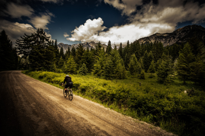
A participant in the 2022 BluMoose Gravel Golden fundraiser for the Golden & District Hospital.