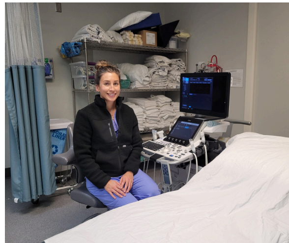
The new bedside ultrasound at Elk Valley Hospital.