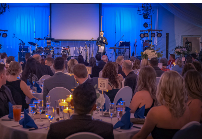
Attendees at the 2022 Starlite Gala presented by Denham Ford raised over $50,000 in support of Foundry East Kootenay.

Across the East Kootenay, we saw many individuals, organizations, and communities come together in support of health care this year.