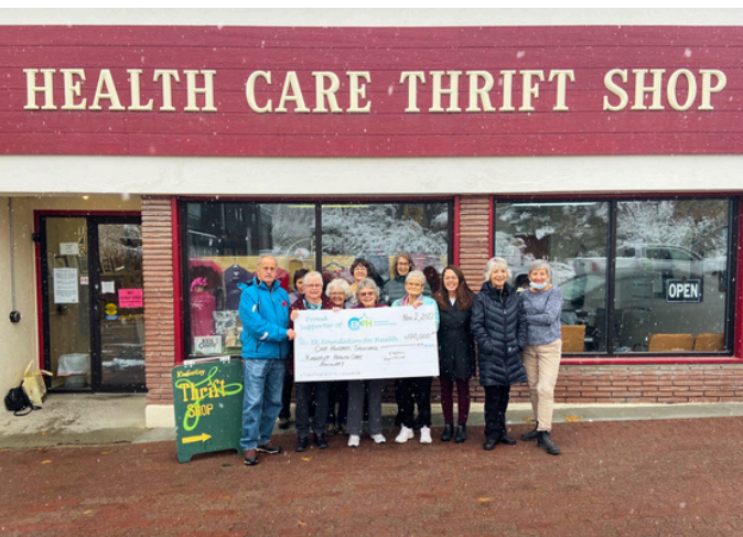
Kimberley Health Care Auxiliary Society presents EKFH with $100,000 towards surgical equipment for EKRH.