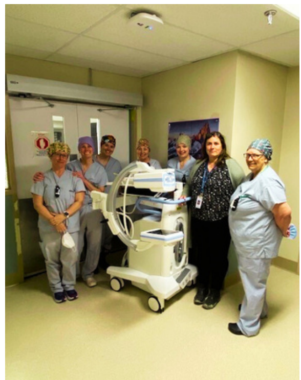
The Golden Hospital Operating Room team poses with the newly acquired Insight Flex Mini C-Arm .